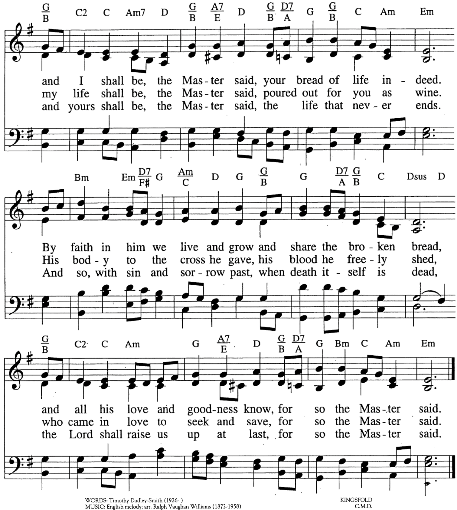
Words © 1988 Hope Publishing Company